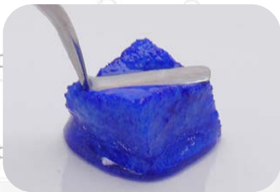
Formable and spongy