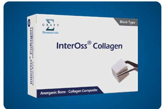
InterOss ® Collagen Block-Type

InterOss ® Collagen is an anorganic hydroxyapatite-collagen composite for use in periodontal, oral and maxillofacial surgery. It is a combination of bovine bone granules and collagen fibers for exceptional handling. Its interconnected porous structure and osteoconductive property allows for the ingrowth of the adjacent viable bone while permitting easy exchange of body fluids. InterOss ® Collagen is available in various sizes in plug and block forms.